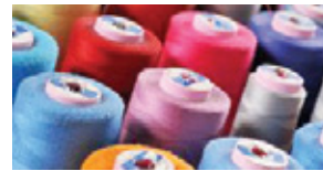
OUR DOWNLIGHT ECO C.R.I. > 80