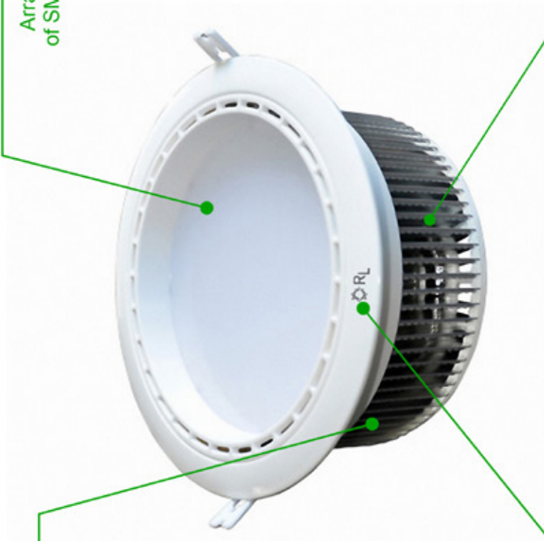
High heat conduction mockup