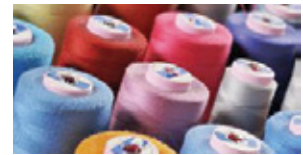
NORMAL LIGHT C.R.I. 70